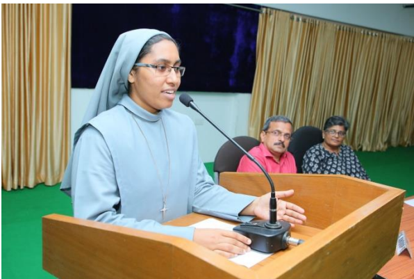
Valedictory Function of Orientation Programme Batch 11