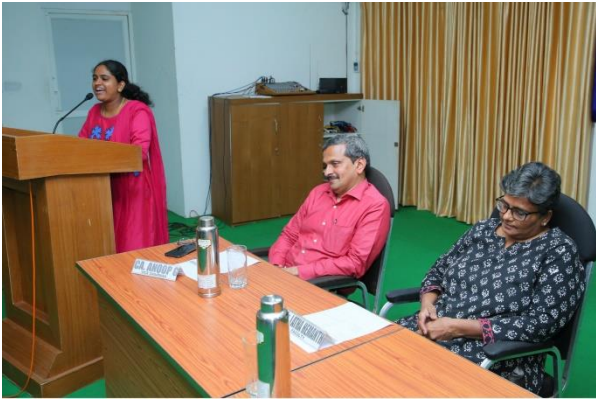
Valedictory Function of Orientation Programme – Batch 11