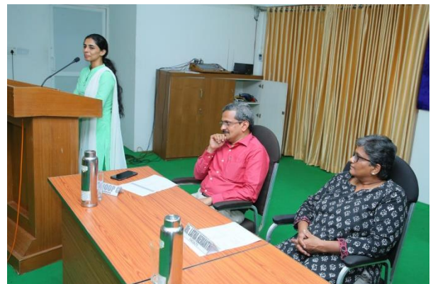
Valedictory Function of Orientation Programme – Batch 11