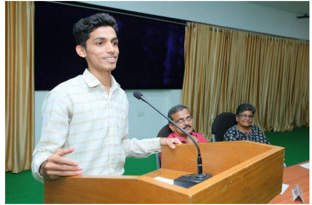
Valedictory Function of Orientation Programme – Batch 11