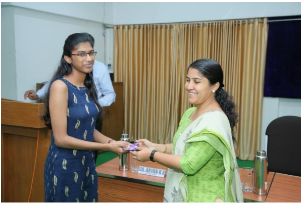
Toppers of Plus Two Exam being honoured by Chapter