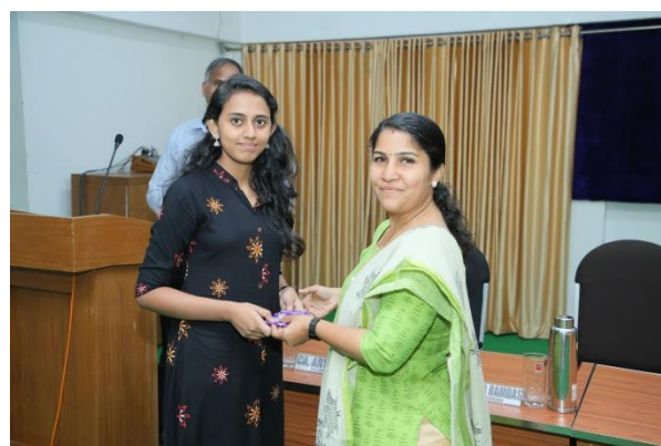
Toppers of Plus Two Exam being honoured by Chapter