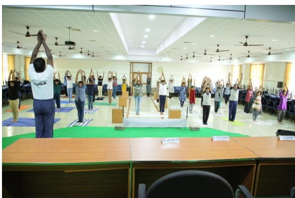
Yoga Session as a part of 5 th International Yoga Day on 21.06.2019