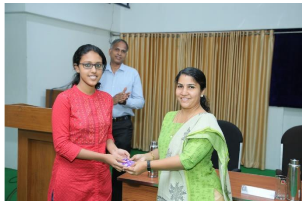
Toppers of Plus Two Exam being honoured by Chapter