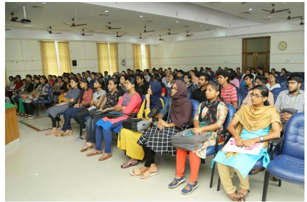
Awareness Programme – CA Foundation Course conducted on 22.06.2019