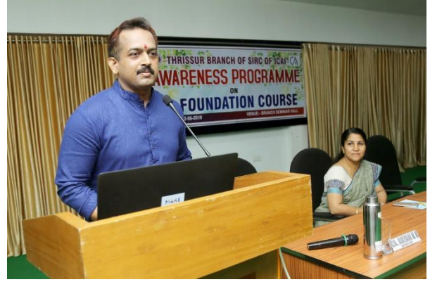
Awareness Programme – CA Foundation Course conducted on 22.06.2019