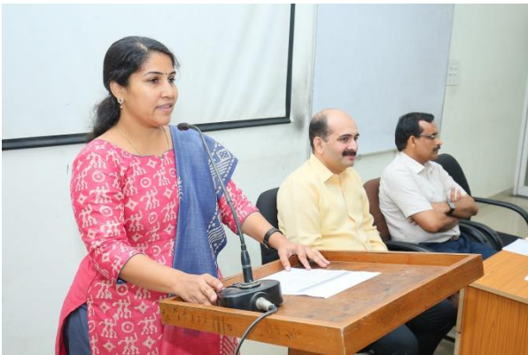
Valedictory function of ICITSS - Orientation Programme Batch-12 on 30.06.2019