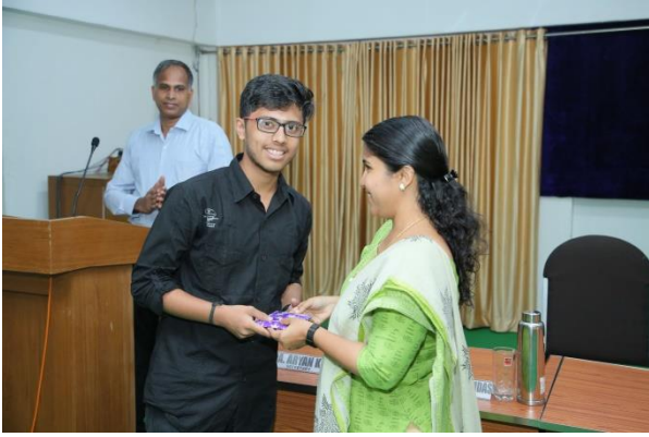
Toppers of Plus Two Exam being honoured by Chapter