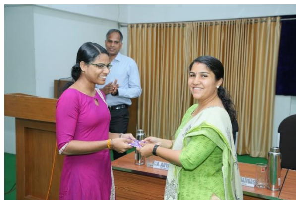
Toppers of Plus Two Exam being honoured by Chapter