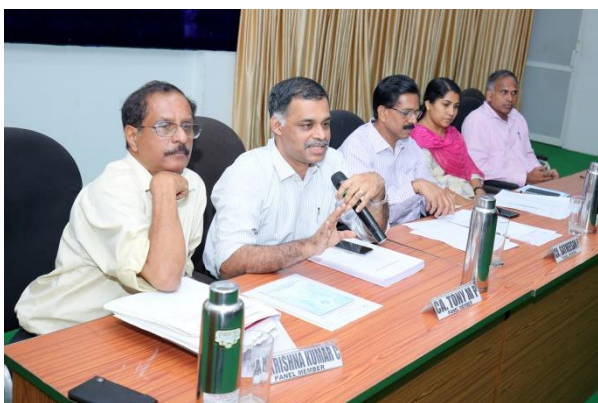
Panel Discussion on GST Annual Return on 13.06.2019